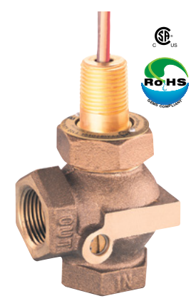
FS-400 Adjustable CSA Listed: File No. LR22666