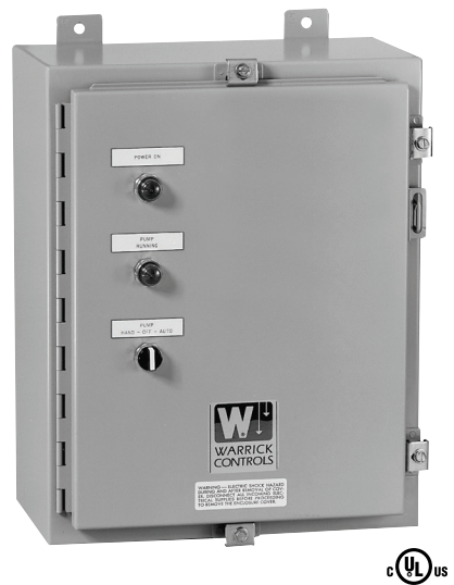
Single-function standard panel