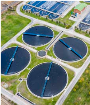
Water & Wastewater