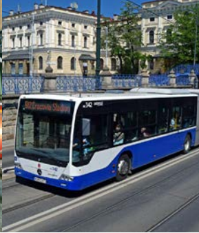
Buses & Recreational